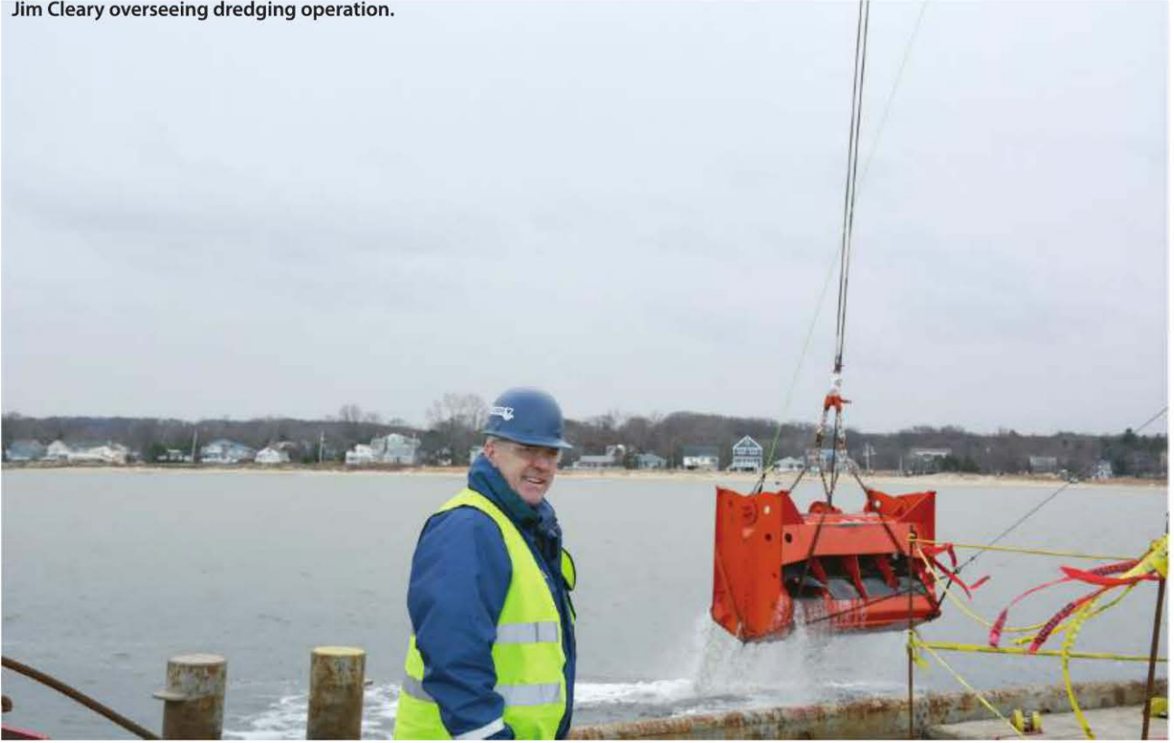
The Gerritsen Bridge Replacement Project.