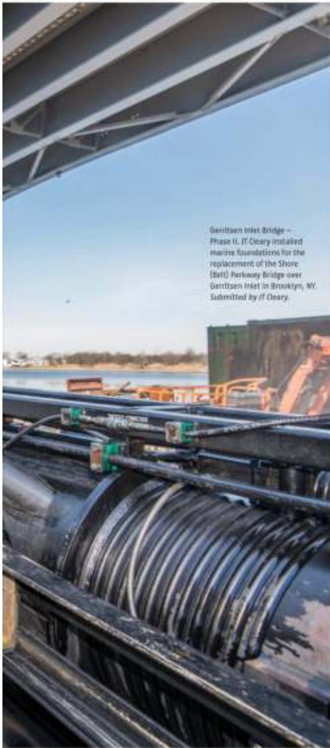
Geritsen Inlet Bridge – Phase II, JT Cleary installed marine foundations for the replacement of the Shore (Bell) Parkway Bridge over Geritsen Inlet in Brooklyn, NY. Submitted by JT Cleary.