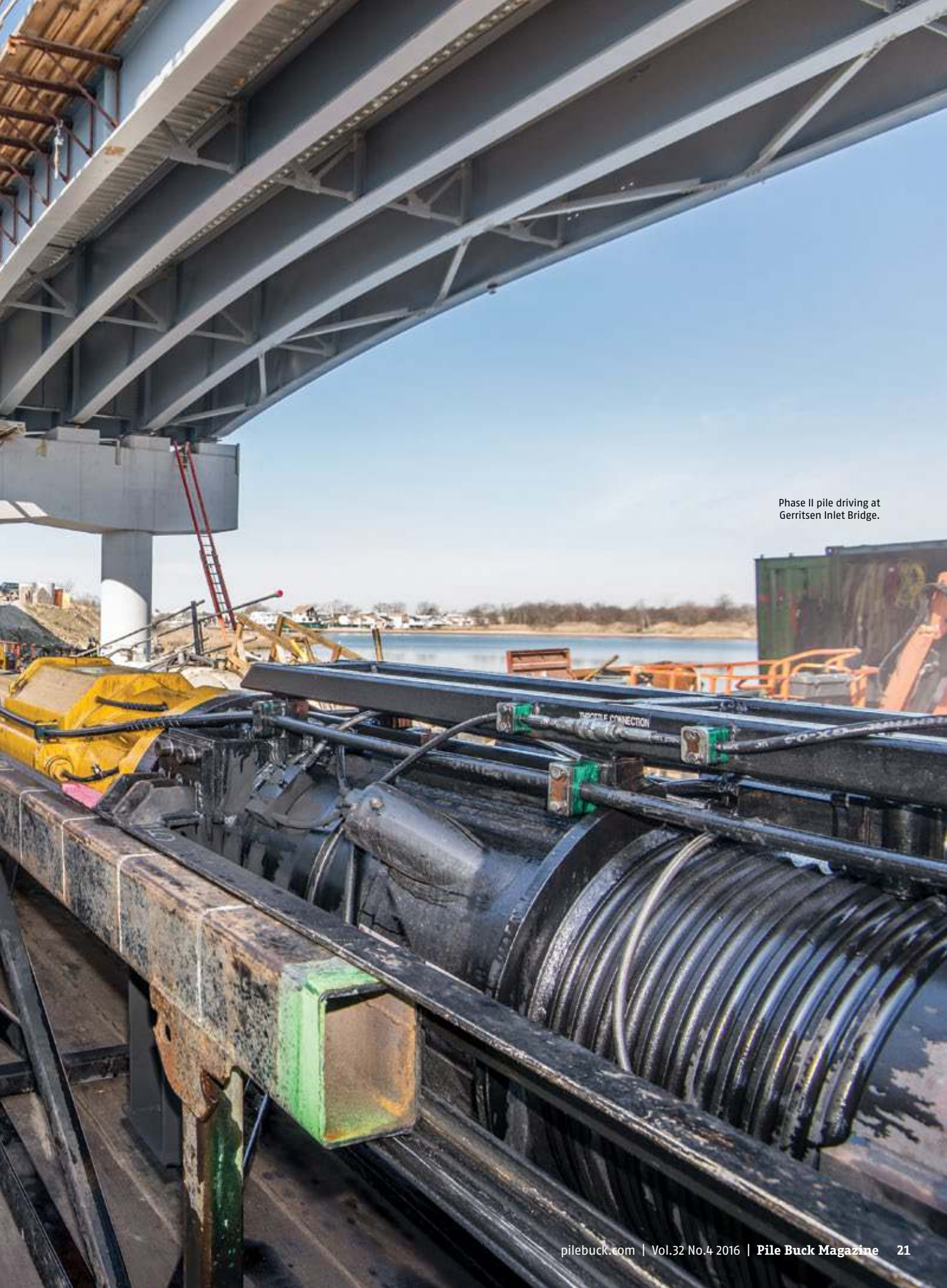
Phase II pile driving at Gerritsen Inlet Bridge.